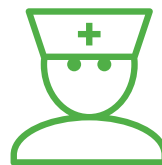
Health centers & service homes