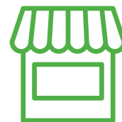
Other small & medium size locations