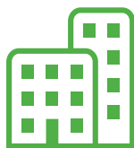
Offices & commercial properties